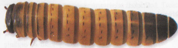
Fig. 3. Zophobus morio