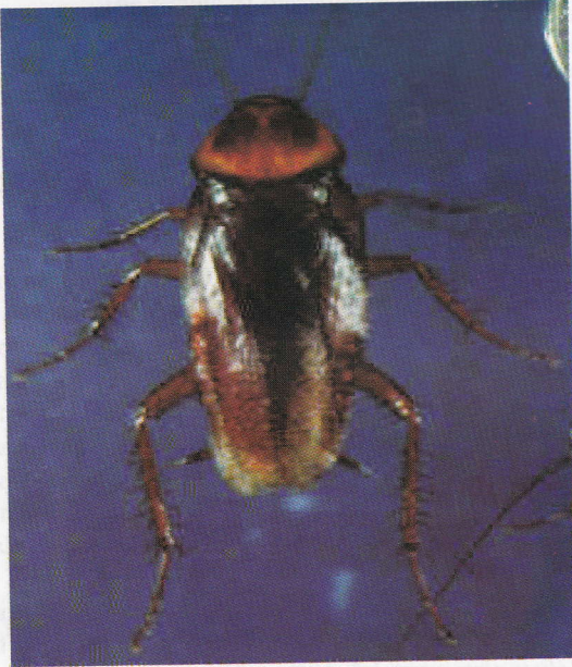
Fig. 1. Periplaneta americana