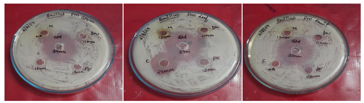
Figure 3: Antibacterial activity of different plant extracts of Pedillum murex against Bacillus .

The results indicate potent antibacterial efficacy of all the tested extracts against Bacillus , with maximum antibacterial efficacy in case of leaf extract followed nearly same antibacterial activity in stem and flower extract. The highest antibacterial efficacy in leaf extract was obtained when petroleum ether was used as a solvent. On the contrary, stem and fruit extract showed highest antibacterial activity when chloroform and methanol