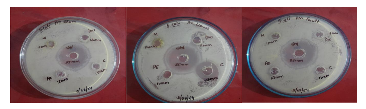
Figure 1: Antibacterial activity of different plant extracts of Pedillum murex against Escherichia coli .

All the tested extracts demonstrated potent antibacterial efficacy against E. coli. , indicating presence of bioactive compounds that serve as potent