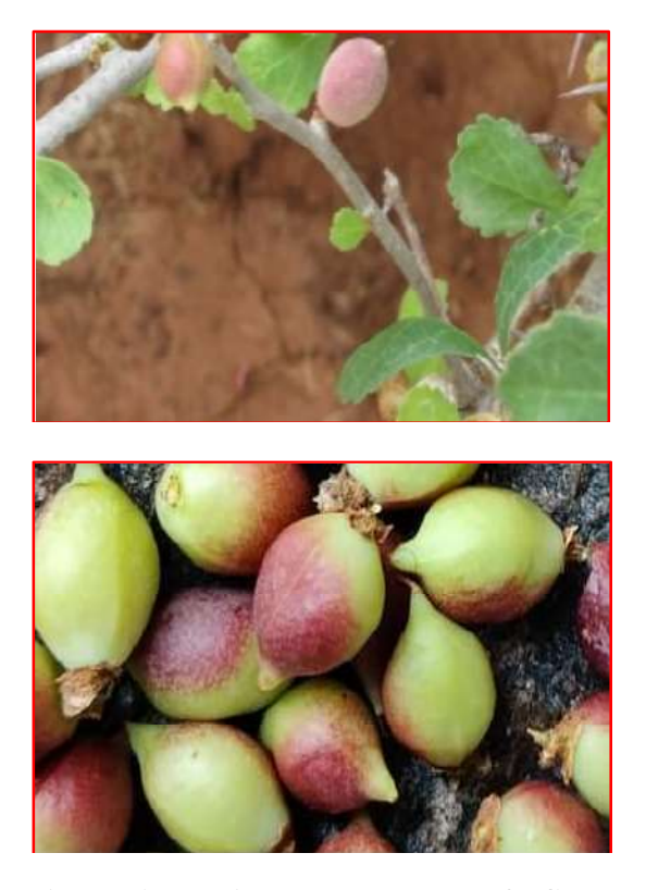
Figure 1: Various plant parts of Guggul (Commiphora wightii)