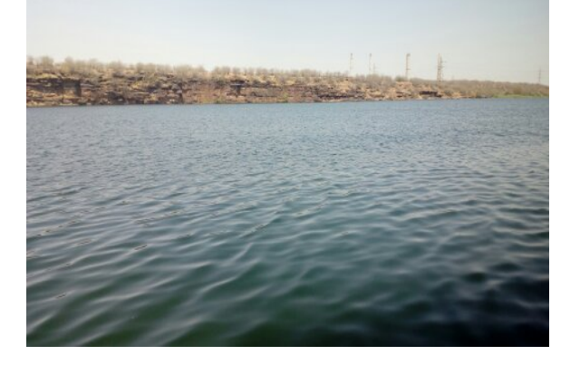
Figure-1: Sample collection Site S-I (near Akelgarh)

For the present investigation two sampling sites were selected on Chambal river. Station I (S-I) was selected at the entry point in upstream of Chambal river in the city near Akelgarh and Station II (S-II) was selected in the downstream of river behind the Chhoti Samadh temple in the middle of the city (Figure 1&2). The Kota Barrage is a dam that divides the flow of river into upstream and downstream.