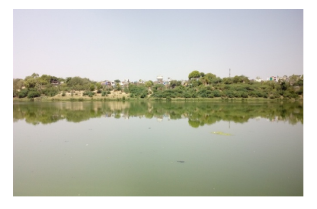
Figure-2: Sample collection Site S-II (behind the Chhoti Samadh Temple)

For the study of species diversity of cyanobacteria the surface water samples were collected in polyethylene bottles from the selected sampling stations S-I and S-II during the summer season from March 2018 to June 2018 in the morning time. With the preparation of fresh mounts in laboratory the collected samples were studied within 48 hrs and also fixed and preserved using Lugol's solution for further detailed examination. The observation microscopic of Cyanobacteria was done using a trinocular research Metzer-M microscope (Model METZ-5000 DTM). Microphotography was done with an imported camera MD500 attached with microscope. Identification of species of cyanobacteria was done with the help of monograph and available relevant literature <sup>12-14</sup> The enumeration of literature The enumeration of cyanobacteria was done using haemocytometer.