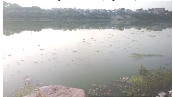
Figure-3: Picture showing human interference at Station II

Oscillatoria was found dominant at both the stations during the summer season. Anabaena, Aphanocapa and Spirulina were not observed at S-II but were observed at S-I during the summer season. Microcystis showed dominance at station II (S-II). Occurrence and dominance of Microcystis is an indicator of organic pollution. As Station II is situated downstream of the Chambal river, it may be concluded that due to more anthropogenic activities and addition of sewage and waste at station II the water is rich in nutrients at downstream that favours the growth of Microcystis resulting in the formation of algal blooms (Figure 3).