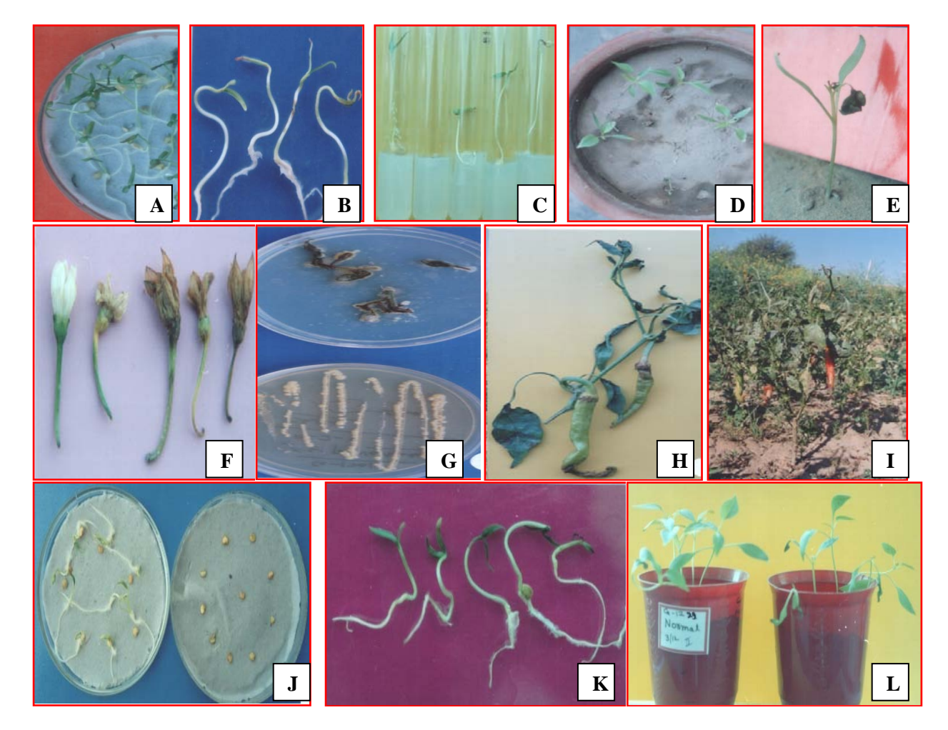
Fig. 2. Infection of Xanthomonas axonopodis pv. vesicatoria in chilli (A&B) seeds in Petri plate method, (C) water agar test tube seedling symptom test, (D & E) pot experiment showing loss of seed germination and blight of leaves, (F & G) infected floral buds and bacterial colony on and around it on NA medium, (H)infected fruits attached on twig showing the blight symptoms (I) infected plant in the field with symptoms; pathogenicity test (J)smothering of seeds, (K) stab inoculation of staple seedlings (8 days) (L) stab inoculation and infilteration of young seedlings (4 leaves stage).

recorded which suggests wide its spread occurrence in Rajasthan state (Table1). It may further build up the inoculum of the pathogen in the fields. The heavy inciden@20%) of the pathogen was recorded in samples belonging to all the districts of Rajasthan. Higher incidence (1-90%)of Xanthomonas campestris pv. campestris was recorded agar by YDC plate method in cluster bean seeds grown in districts of Karnataka<sup>32</sup>.