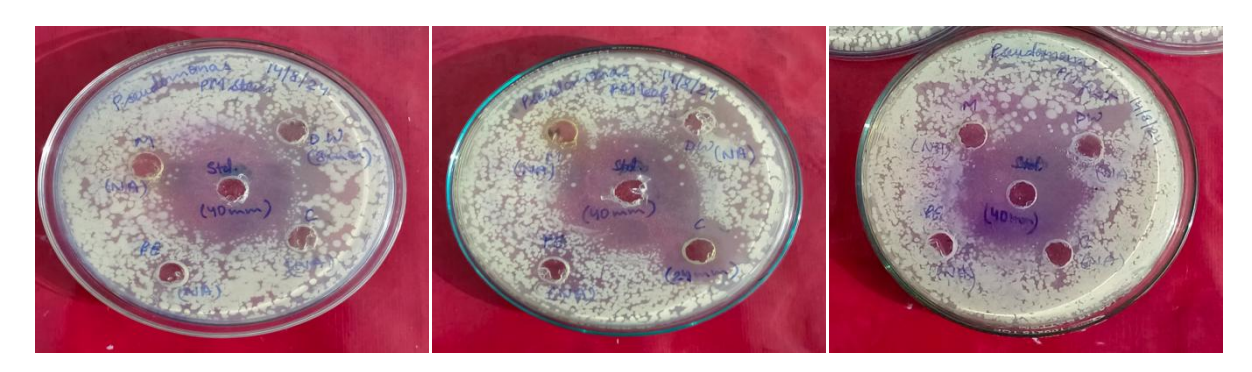
Figure 4: Antibacterial activity of different plant extracts of Pedalium murex against Pseudomonas .