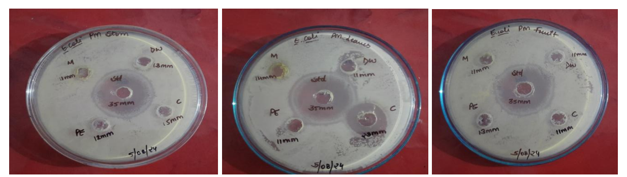
Figure 1: Antibacterial activity of different plant extracts of Pedalium murex against Escherichia coli .

All the tested extracts demonstrated potent antibacterial efficacy against E. coli. , indicating presence of bioactive compounds that serve as potent antibacterial agent in different parts of the plant Pedalium murex . Studies have shown presence of several secondary metabolites in Pedalium murex , such as alkaloids, flavonoids, triterpenes,