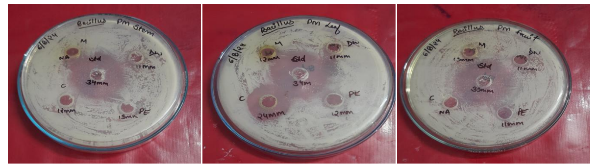
Figure 3: Antibacterial activity of different plant extracts of Pedalium murex against Bacillus .

The results indicate potent antibacterial efficacy of all the tested extracts against Bacillus, with maximum antibacterial efficacy in case of leaf extract followed nearly same antibacterial activity in stem and flower extract. The highest antibacterial efficacy in leaf extract was obtained when petroleum ether was used as a solvent. On the contrary, stem and fruit showed highest extract antibacterial activity when chloroform and methanol were used as solvents respectively. The order of diameter of inhibition zone (indicative of antibacterial efficacy of the plant extracts) was as follows: