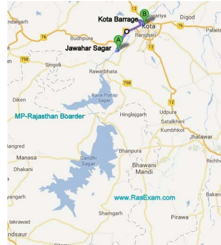
Fig. 2 Various dams constructed on Chambal river