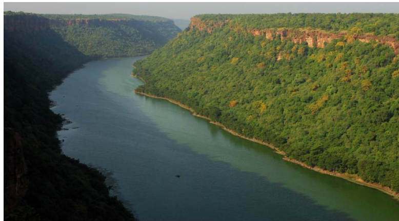
Fig. 3 Chambal River

The evidence of their origin can be traced through carbon isotopic data and study of microfossils which states their dominance during Precambrian period 3,4 . These are the most successful organisms that are in existence for billions of years and are still exploiting every possible extreme of habitats 5 . Cyanobacterial cells contain chlorophyll- a, beta carotene, c-phycocyanin, allophycocyanin and c-phycoerythrin with membrane bound nucleus and plastids lacking (prokaryotic cell structure). Motile reproductive cells are